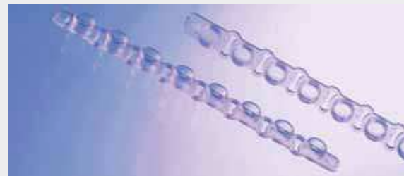
Figure 2: 8-cap strips for Real Time PCR

Additionally available in the PCR product programme are 8-cap strips for Real Time PCR (Fig. 2). Like the standard cap strips, the 8-cap option reliably seals the 8-tube strips in addition to all Greiner Bio-One polypropylene 96 well PCR microplates. In contrast to the domed standard cap strips, they have a flat lid and are made of highly transparent polypropylene. These are ideal for Real Time PCR applications, and are compatible with most Real Time PCR devices, such as the ABI Prism 7700, the MX4000 (Stratagene) or the DNA Engine Opticon (MJ Research).